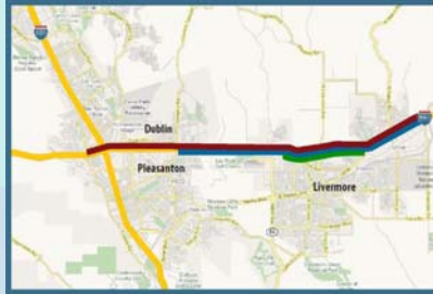
■ EB Auxiliary Lane