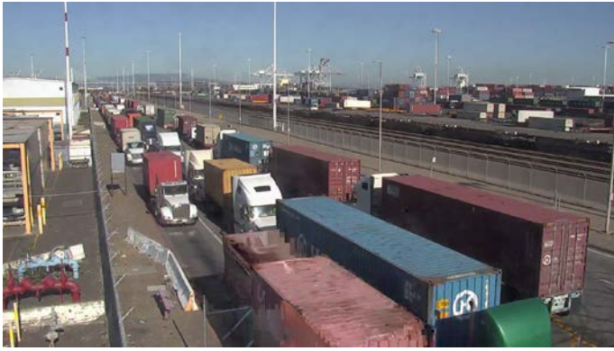
Congestion, bottlenecks, and trucks queuing at the Port of Oakland.