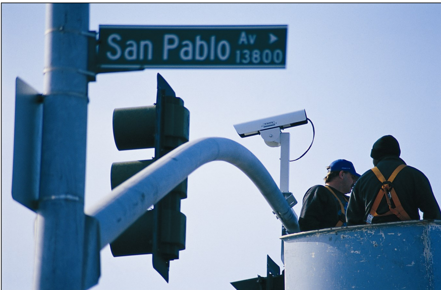
Installation of ATMS components.

Yearly contract for maintenance services currently funded through September 2016.