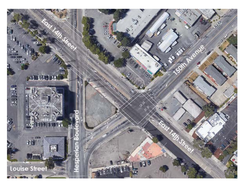
Arial view of the project location at the intersections of East 14th Street, Hesperian Boulevard and 150th Avenue.