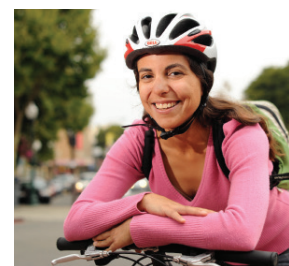
Measure B funds local streets and roads and mass transit services, bicycle and pedestrian safety projects, better access for seniors and people with disabilities, and highway improvements.