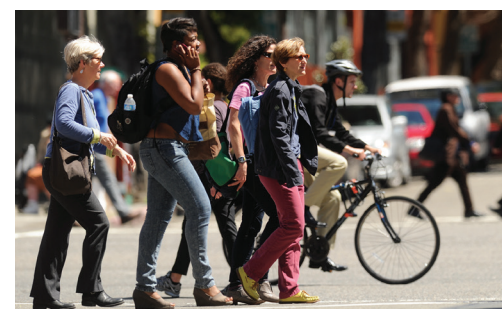
Measure B funds local streets and roads and mass transit services, improves bicycle and pedestrian safety, provides better access for seniors and people with disabilities, and improves highway efficiencies.