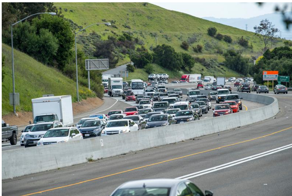
The northbound I-680 Sunol Express Lane under construction.

On April 19, Alameda CTC and Caltrans held a ceremonial groundbreaking for the new northbound express lane on I-680 over the Sunol Grade. The event commemorated the start of construction of nine miles of a high occupancy vehicle (HOV)/continuous access express lane in the northbound direction on I-680 between State Route 262/Auto Mall Parkway and State Route 84 (SR-84). Additionally, the adjacent I-680 Southbound Express Lane will be upgraded for improved access. This new express lane will promote carpooling and ridesharing, facilitate the smooth and safe transition of traffic between local streets and the freeway between interchanges, help alleviate traffic congestion and improve operations along one of the most congested corridors in the region. Follow the project progress on the Express Lanes Facebook page.