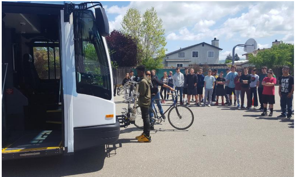
Student Transit Pass Pilot Program shows students how to safely take their bikes on the bus.

The Measure BB-funded Student Transit Pass Pilot Program is concluding its second year - another highly successful year. At the April 26 Commission meeting, Alameda CTC approved funding for the third year of the pilot program. Because the program has been such a success, Alameda CTC is working to determine how to expand and fund the program permanently, including leveraging Measure BB dollars further and securing other. Travel training has been underway this spring in a number of participating middle schools. Program staff have been providing education to students on how to safely ride the bus and how take your bike on the bus to school and after school activities. Alameda CTC is working on developing the next generation of transit riders! A report on the pilot program's second year will be available this fall. The first year report can be found here: