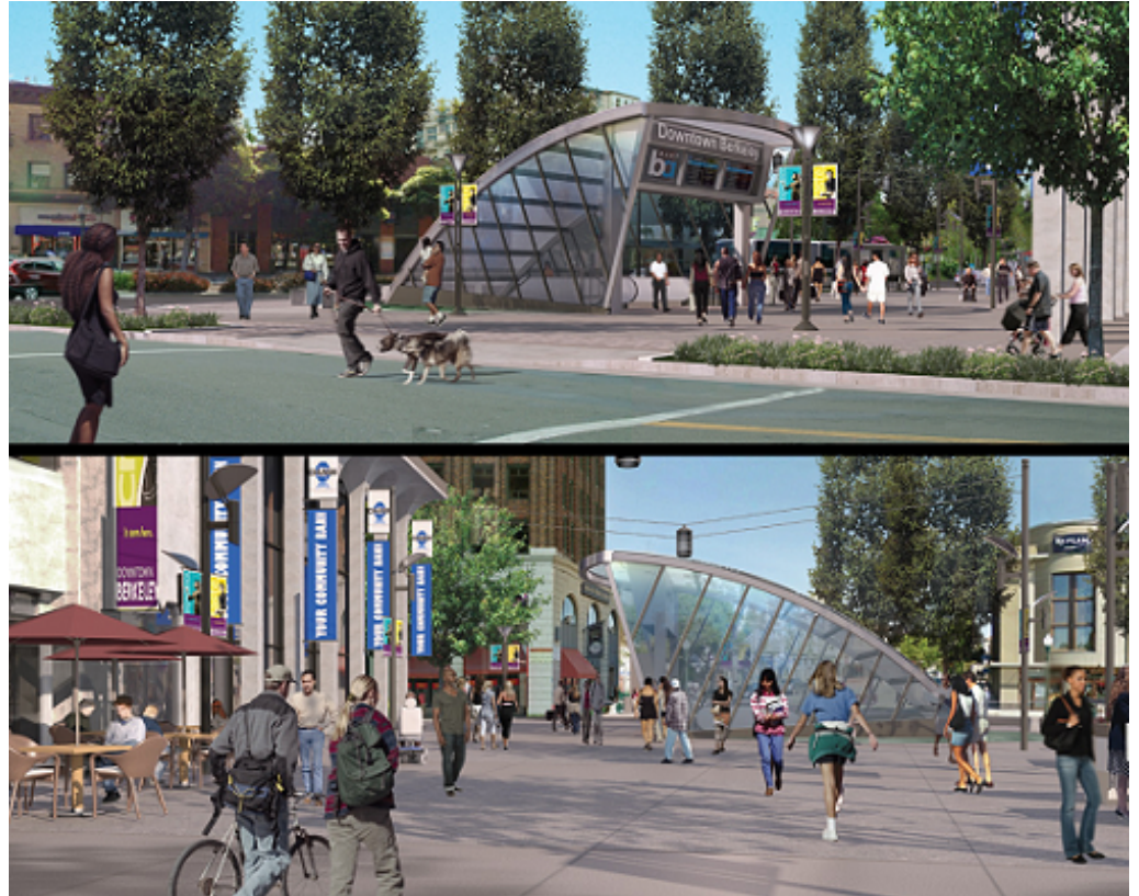
An artist's rendering of the new station improvements at the Downtown Berkeley BART plaza.

By late summer 2018 construction will be complete at the Downtown Berkeley BART station, creating a dramatic new look and functional design that improves safety, walkability, access and multimodal connections for commuters, students and residents alike. Improvements include new BART entrance structures, bus shelters, public plaza resurfacing, lighting, curb ramps and bike parking. BART received awards from Alameda CTC and the Metropolitan Transportation Commission for both local and federal funds to construct these improvements to the BART station and AC Transit hub. This project is a joint effort between BART and the City of Berkeley.