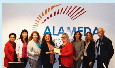
Representatives from Oliveira Elementary received their award from Alameda CTC commissioners during a ceremony held on April 26.

Congratulations to Oliveira Elementary School in Fremont , winner of the 2018 Platinum Sneaker Award for greatest percent increase in use of green modes of transport to school during the Golden Sneaker Contest. During the contest 66 percent of participating Oliveira students used either active or shared transportation for their daily commutes.