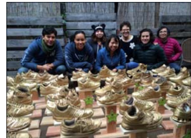
Students pose in front of the Golden Sneakers donated by the Golden State Warriors. These were handed out to the winning classes.

Approximately 65,000 students throughout Alameda County walked, biked, rolled, carpoled and took transit as much as possible from February 26 to March 9, competing in the Safe Routes to Schools Golden Sneaker Contest . This year, students and classes from 101 Alameda County elementary and middle schools participated. Classrooms with the highest participation won trophies made with sneakers donated by the Golden State Warriors! Competing for these coveted awards helps support healthy transportation choices and habits that we hope will last a lifetime. Oliveira Elementary School in Fremont had the highest increase in green modes during the contest, and will be honored with the Platinum Sneaker Award at the April 26 Alameda CTC Commission meeting.