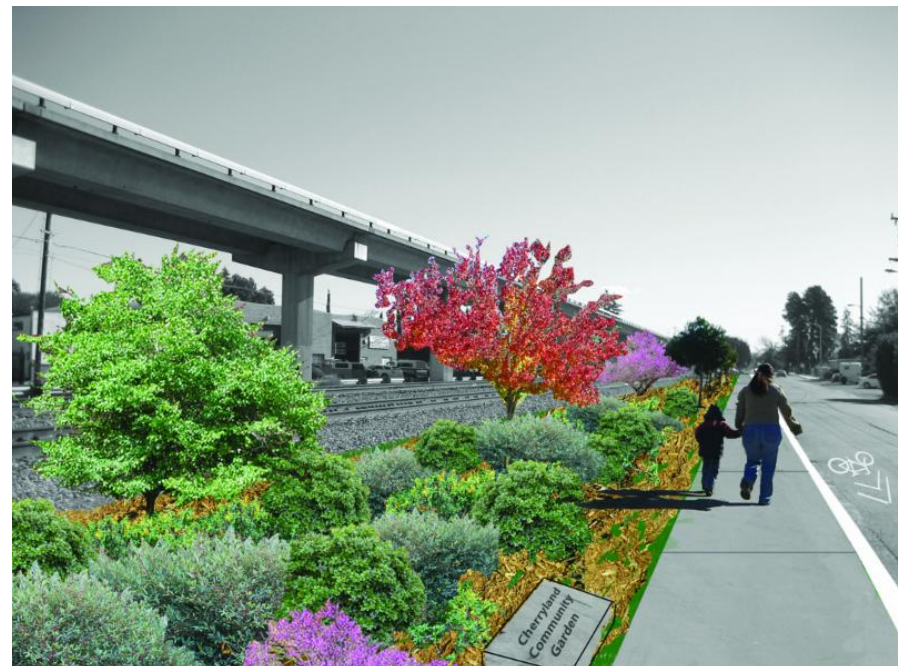
Rendering of Eastbay Greenway in unincorporated Cherryland near north Hayward.