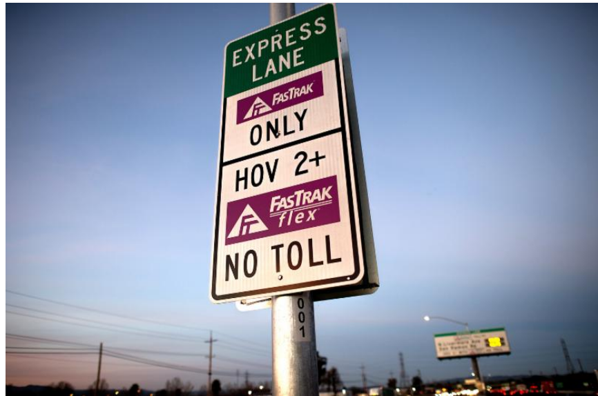
As of February 2018, travelers have made over 15.8 million trips on the I-580 express lanes.