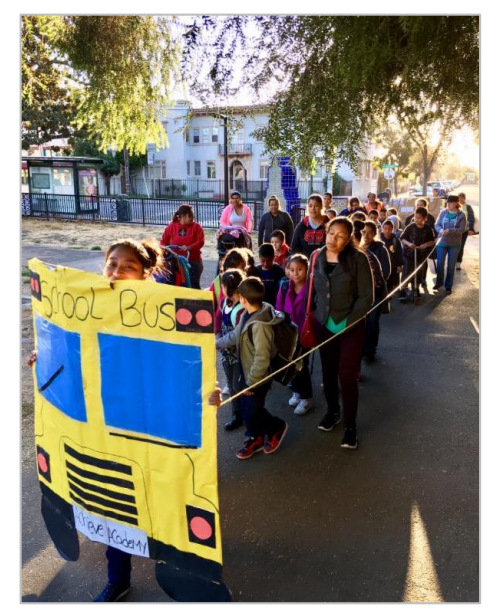
Students walk together in a Walking School Bus at Achieve Academy in Oakland, Calif.