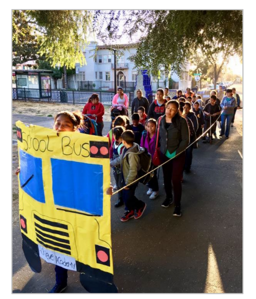
Students walk together in a Walking School Bus at Achieve Academy in Oakland, Calif.