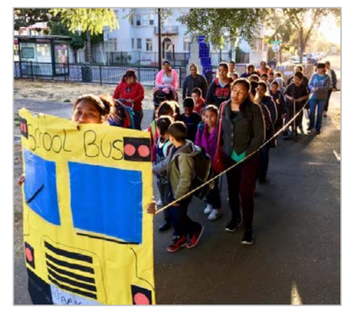
Students walk together in a Walking School Bus at Achieve Academy in Oakland, Calif.