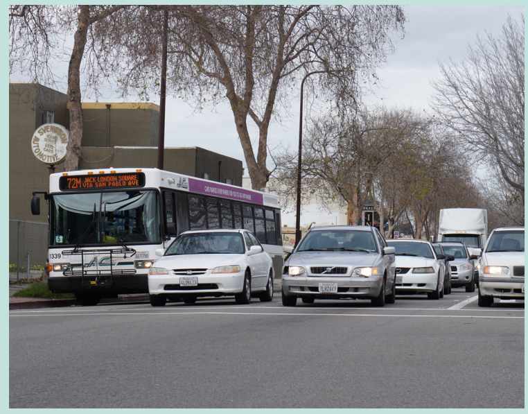
Existing Conditions on San Pablo Avenue

Near-term safety and transit improvements are planned for construction as quickly as possible.