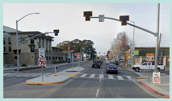
Pedestrian Hybrid Beacons are traffic signals that pedestrians or bicyclists activate to require vehicles to stop.