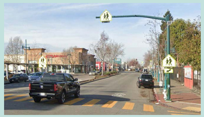
Rectangular Rapid Flashing Beacons are flashing lights that warn drivers when pedestrians are in the crosswalk.