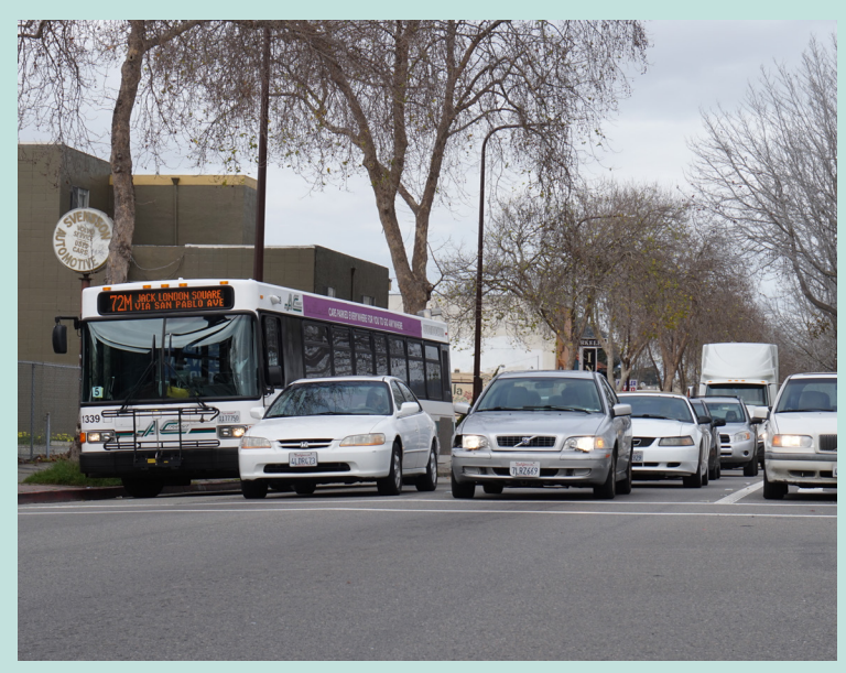
Existing Conditions on San Pablo Avenue

What improvements are coming to San Pablo Avenue? Near-term safety and transit improvements are planned for construction as quickly as possible.