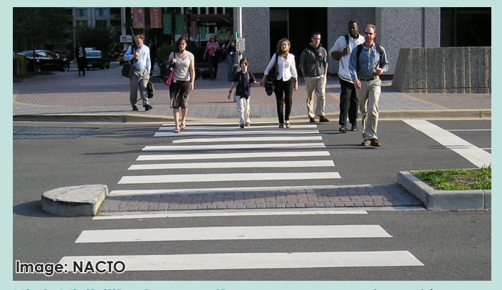
High Visibility Crosswalks are pavement markings that are more visible to drivers and therefore allow for safer street crossings for pedestrians.