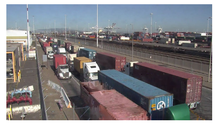
Congestion, bottlenecks, and trucks queuing at the Port of Oakland.