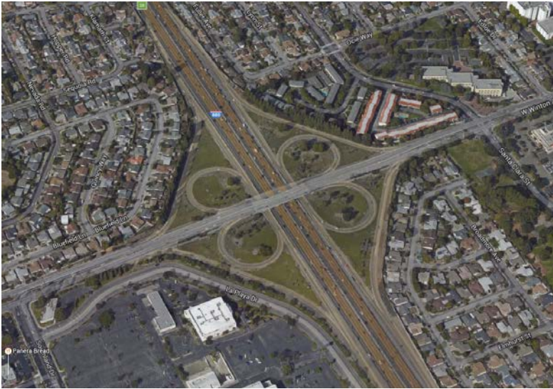
Current interchange at I-880/Winton Avenue.