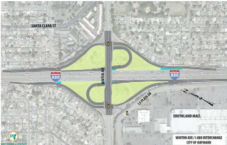
Preliminary interchange geometric at the I-880/Winton Avenue interchange.