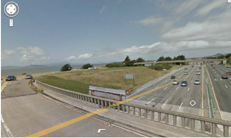
I-80/Ashby Avenue interchange from Google Maps.