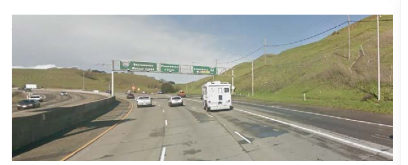
I-680 northbound approaching the SR-84 off-ramp in Sunol.