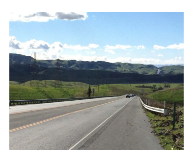
SR-84 looking eastbound near Ruby Hill Road.