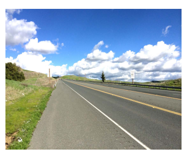
SR-84 looking westbound near Ruby Hill Road.