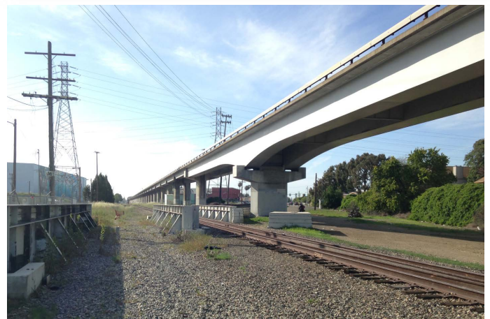
Project corridor in San Leandro south shared by UPRR – an active freight rail line.