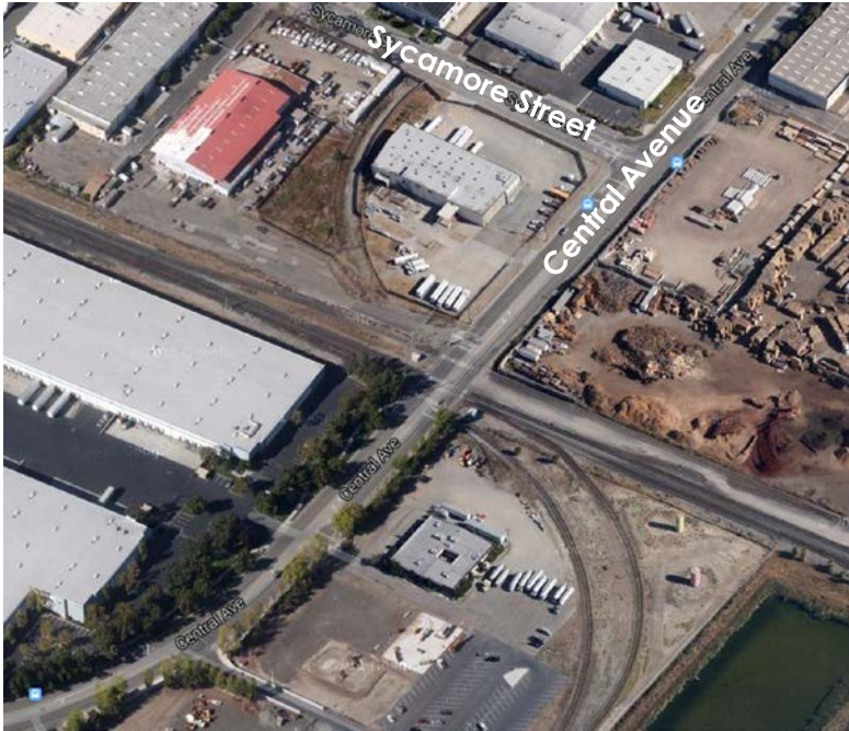
Central Avenue near Sycamore Street.