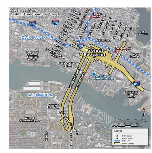
Map of the project footprint of the Oakland Alameda Access Project.

Oakland Alameda Access Project moves to the detailed design phase of project development