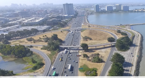
Aerial view of the Interstate 80/Ashby Avenue project area.

Well-attended virtual public open house for I-80/Ashby project