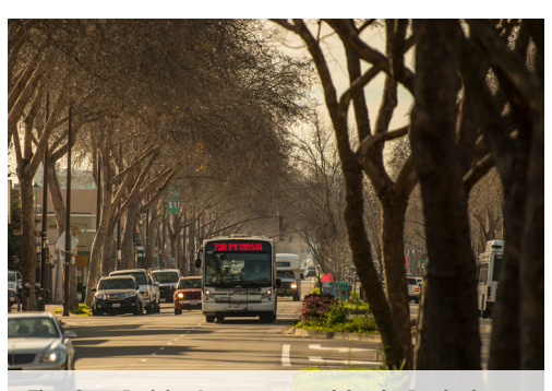
The San Pablo Avenue corridor in Berkeley.

Alameda CTC is leading two multimodal arterial corridor projects that address safety and transit efficiency to support mode shift, economic vitality, sustainable growth and equity—the San Pablo Avenue Corridor Project (SPA) and the East 14th Street/Mission Boulevard and Fremont Boulevard Multimodal Corridor Project (E. 14th/Mission/Fremont).