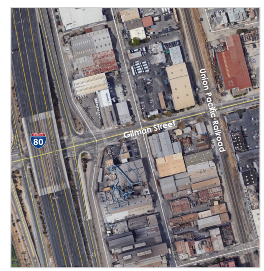
Aerial view of the Interstate 80/Gilman Street Interchange Improvement project at the Union Pacific Railroad crossing.

and signage. The project also closes the crossing at Camelia Street, which will eliminate potential safety conflicts at this crossing.