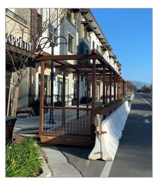
COVID-19 Rapid Response Bicycle and Pedestrian Grant Program project for Complete Streets, City of Fremont

April 8 – The Alameda County Technical Advisory Committee (ACTAC) approved the State Transit Assistance (STA) Block Grant Distribution Formula for FYs 2021-22 and 2022-23. The STA County Block Grant Program allows each county to determine how best to invest in transit operating needs, including paratransit and lifeline transit services. As per the Metropolitan Transporation Commission's (MTC's) initial FY 2021-22 STA Fund Estimate, adopted February 2021, Alameda County's estimated new revenue for the STA Block Grant is $ 6,630,338. MTC is anticipated to release its FY 2022-23 STA Fund Estimate in February 2022. Committee members also approved the Measure B, Measure BB and Vehicle Registration Fee Programs Update and Interim Policy Updates. An update on the County's Vehicle-Miles Traveled (VMT) Reduction Estimator Tool was shared with the committee. This tool is being developed as a resource to assist our member agencies with the implementation of the requirements of SB 743.