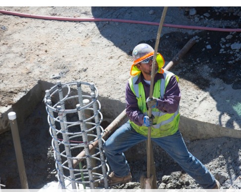
Construction on Interstate 680 northbound, Courtesy of Caltrans.

continues during this time. They quickly established and deployed the tools necessary for all staff to continue operating remotely to deliver essential projects, programs and planning efforts for Alameda County residents and businesses.