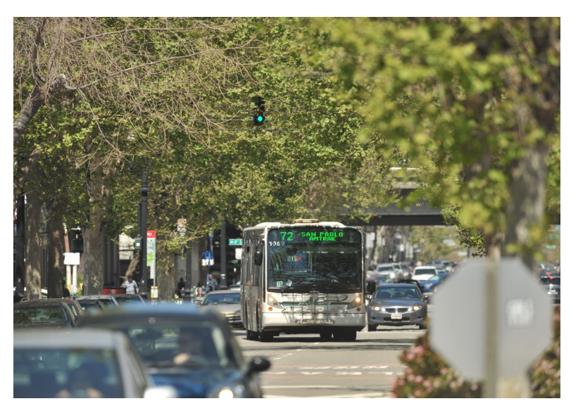
Alameda-Contra Costa Transit District bus traveling on San Pablo Avenue.