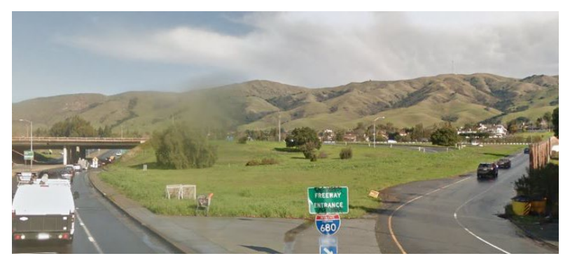
Eastbound SR-262 at the I-680 southbound on-ramp.