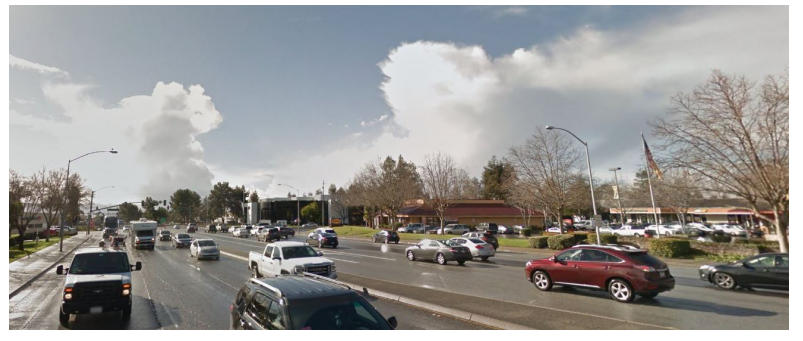
Westbound and eastbound traffic on SR-262 in Fremont.