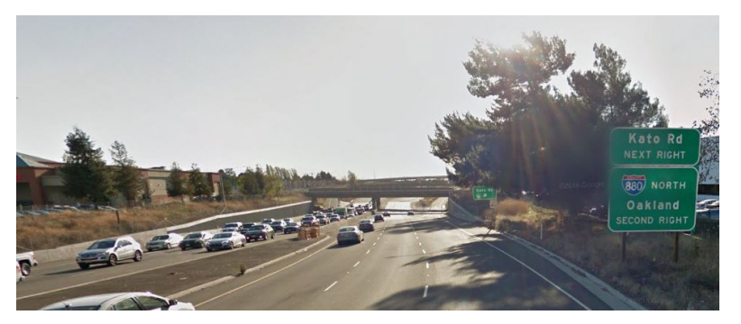
Westbound congestion along SR-262 during the afternoon commute.