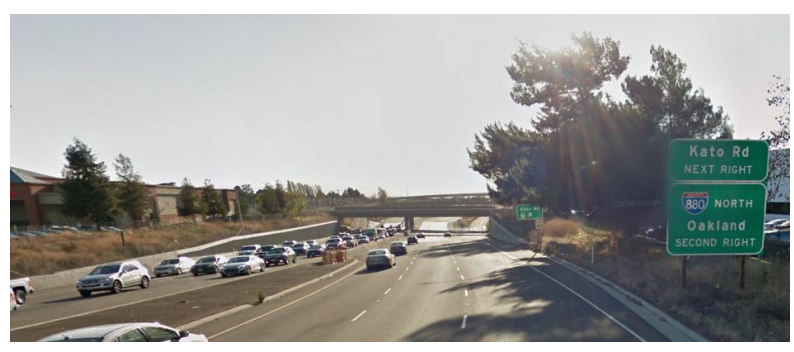
Westbound congestion along SR-262 during the afternoon commute.