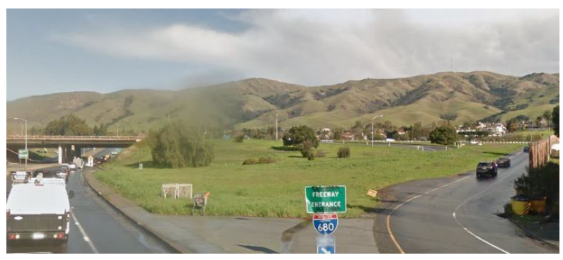
Eastbound SR-262 at the I-680 southbound on-ramp.