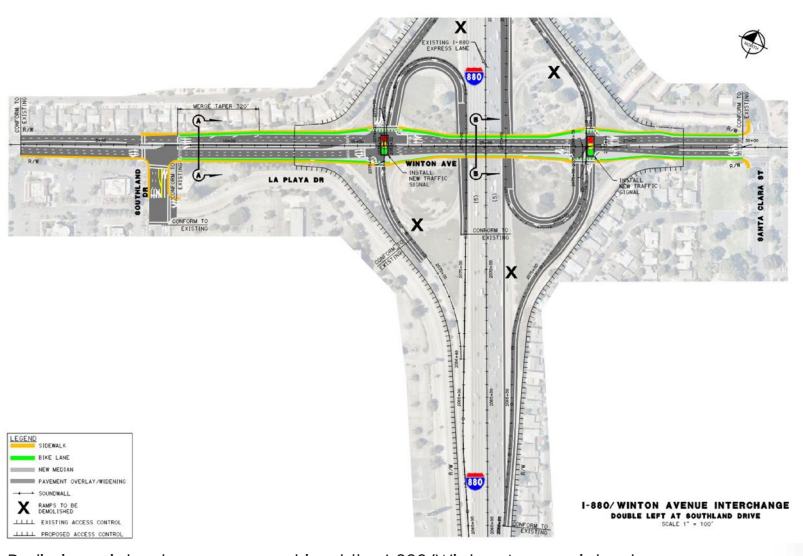
Preliminary interchange geometric at the I-880/Winton Avenue interchange.

Note: Cost estimates for the subsequent work will be determined during the PE/Environmental phase.