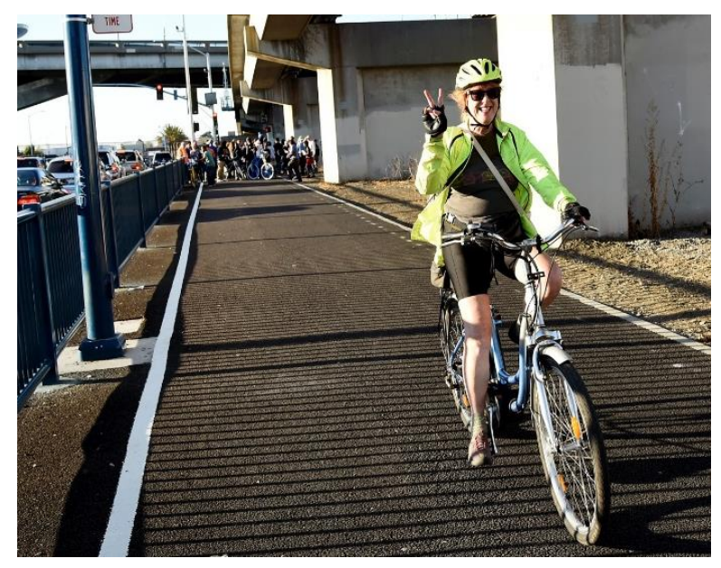
Initial East Bay Greenway segment from Coliseum BART to 85th Avenue (funded by Measure WW, TIGER and BAAQMD).

Current Phase: Preliminary Engineering/Environmental