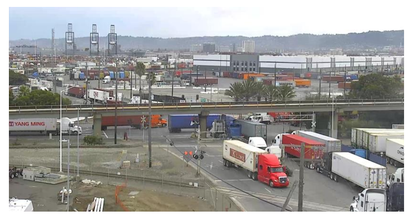
Congestion in the 7th Street/Maritime vicinity.