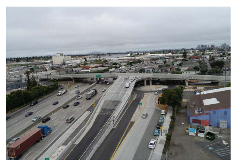
29th Avenue off-ramp and roundabout and overcrossing structure.