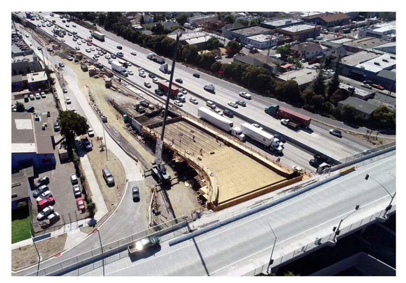
29th Avenue off-ramp under construction, courtesy of Caltrans.