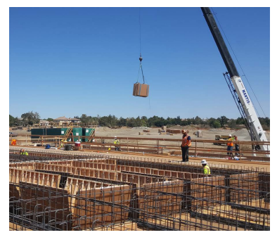
Construction of bridge widening at Arroyo Del Valle.