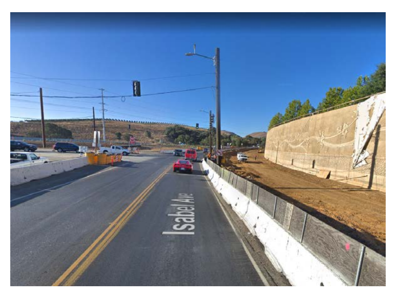
Southbound on Isabel Avenue at Vallecitos Road.