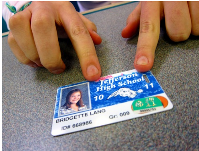
Figure 0-8 School ID with TriMet YouthPass Sticker

0-8Error! Reference source not found. ), allows students to board any TriMet vehicle for free during the school year by simply showing their student ID card. This method was selected for its ease of implementation and use, in addition to the difficulty it presents for duplication, as a means to prevent fraud. Portland Public School IDs for high schools with a valid TriMet logo are honored for unlimited rides without time or day restrictions as long as travel occurs during the academic year.