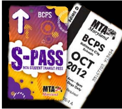
Figure 0-1 Maryland Transit Administration Student Transit Pass (S-Pass)