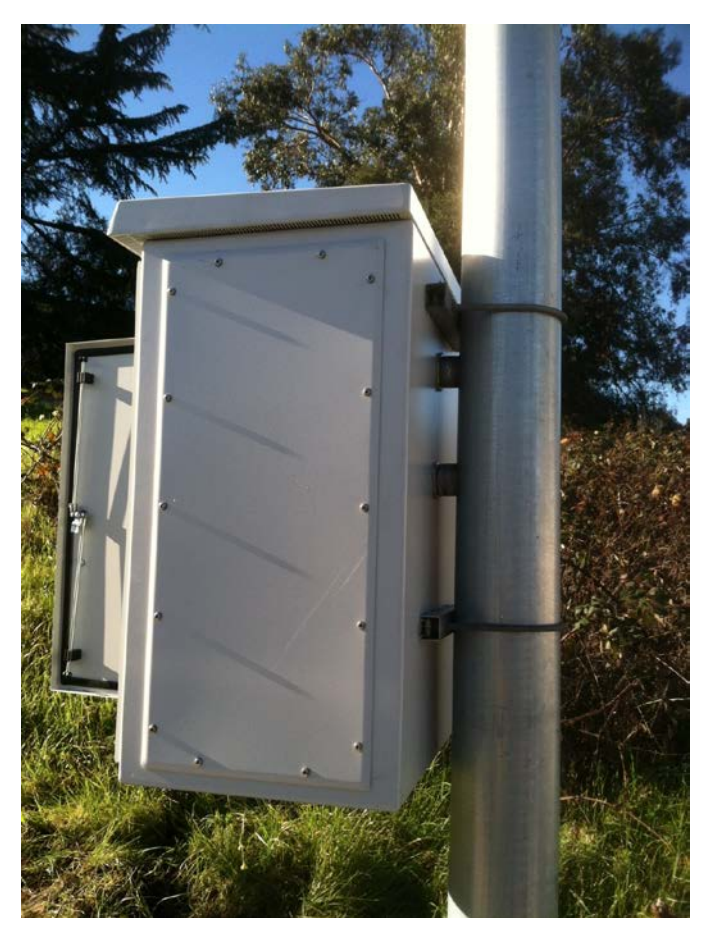
CCTV Cabinet – Various Locations