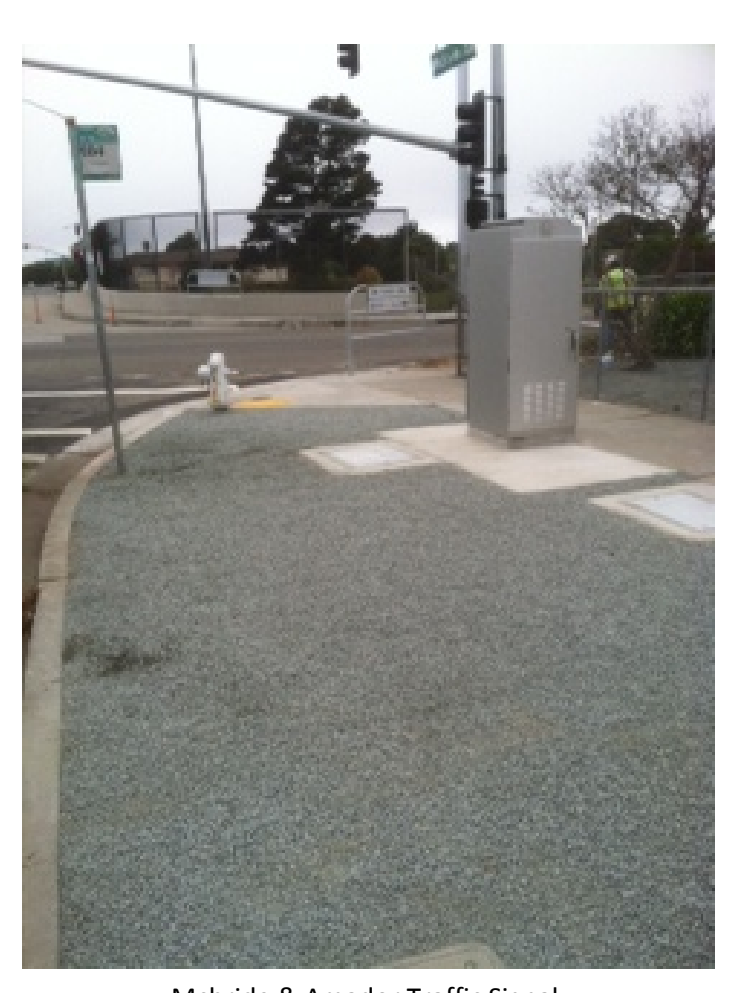
Mcbride & Amador Traffic Signal