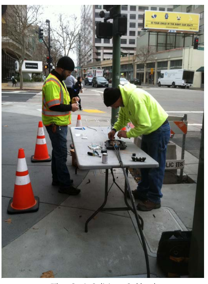
Fiber Optic Splicing - Oakland