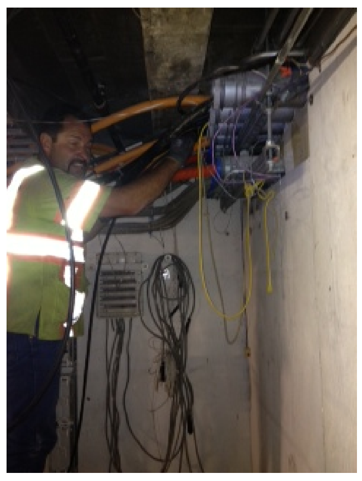
Fiber Installation under Oakland City Hall