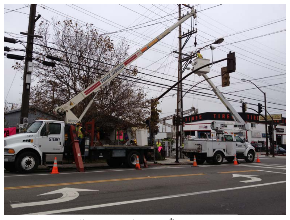
Traffic Signal Modification – 6<sup>th</sup> & Gilman