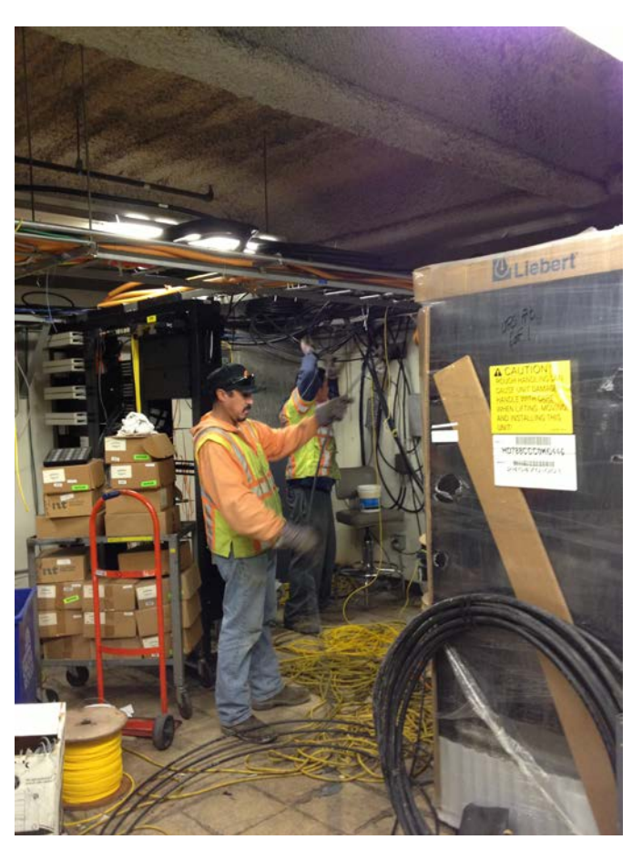
Fiber Optic Installation under Oakland City Hall