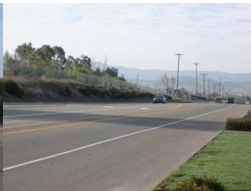
Left: View of existing California State Route 84 (SR 84) looking north near Jack London Blvd. in Livermore, CA.