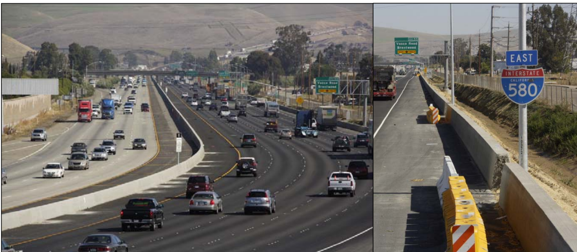
New Interstate 580 Eastbound HOV Lane in Livermore, CA.

Note: The information on this fact sheet is subject to periodic updates.