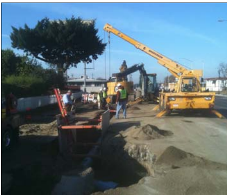
Trenching activities and placement of EBMUD waterline along E. Lewelling Blvd. in San Leandro, CA.