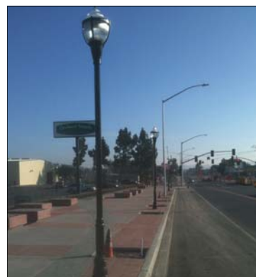
Newly textured sidewalk in front of the Orchard Supply Hardware store along E. Lewelling Blvd. in San Leandro, CA.

Note: The information on this fact sheet is subject to periodic updates.