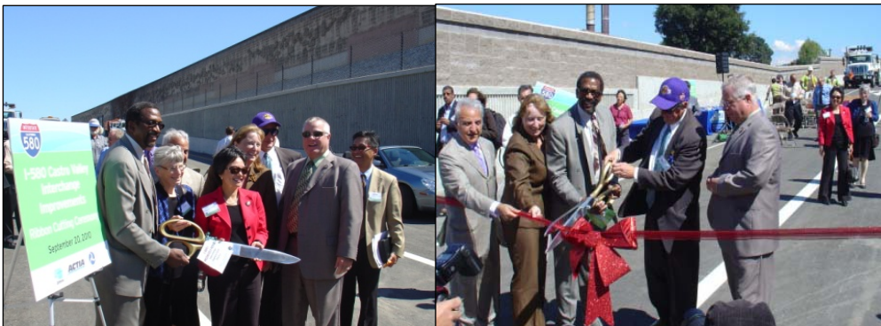
Ribbon cutting ceremony; opening of new interchange at Redwood Road and new eastbound off-ramp from I-580 to Grove Way.

Note: The information on this fact sheet is subject to periodic updates.