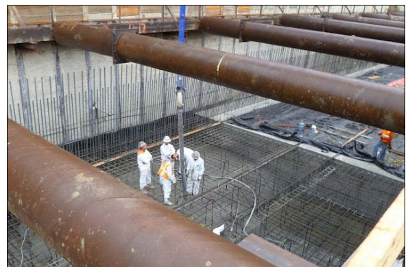
Right: Central Park construction activities, February 2012.

Note: The information on this fact sheet is subject to periodic updates.