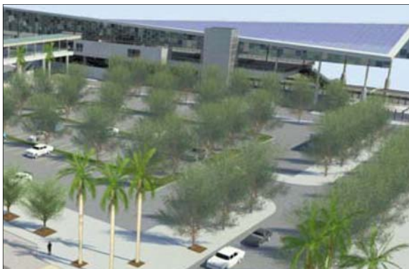
Left: Architectural rendition of future Warm Springs BART Station.