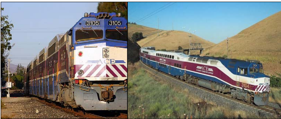
Altamont Commuter Express (ACE) Rail Train

Note: The information on this fact sheet is subject to periodic updates.