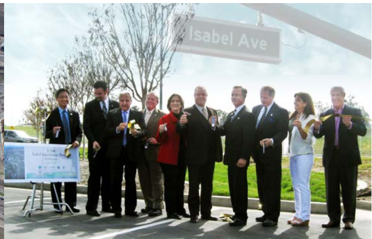
Left: Aerial view of newly constructed Rte 84/ I-580 Isabel Interchange in Livermore, CA. Right: Ribbon Cutting Ceremony held March 30, 2012 to celebrate completion of the project.

Note: The information on this fact sheet is subject to periodic updates.