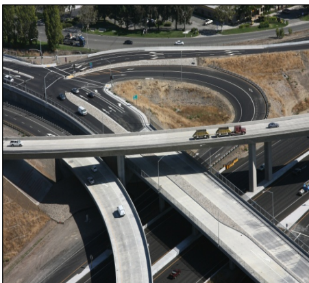
Left: Phase 1A, Aerial view of the reconfigured Interstate 880 / Mission Blvd. (Route 262) Interchange Reconstruction.