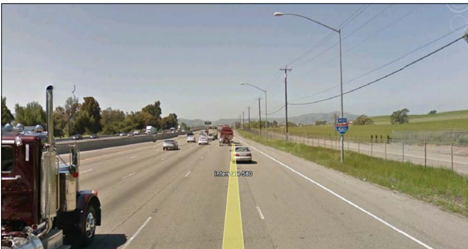
View of Interstate 580 looking west from Airway Boulevard to Fallon Road; location of future I-580 Westbound AUX Lane Project.

* Project Schedule from CMA 724.0: I-580 Westbound HOV Lane Project (East Segment)