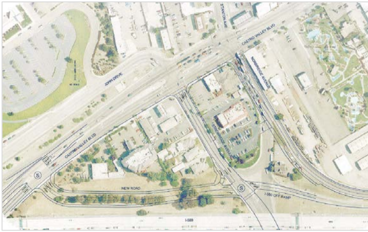
Project development activities on the Strobridge Avenue Extension project.